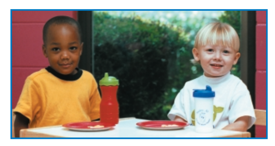
*...permanent teeth are meant to last the rest of your life.